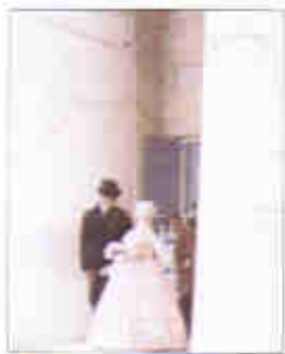
The newweds on the porch of Arlington House